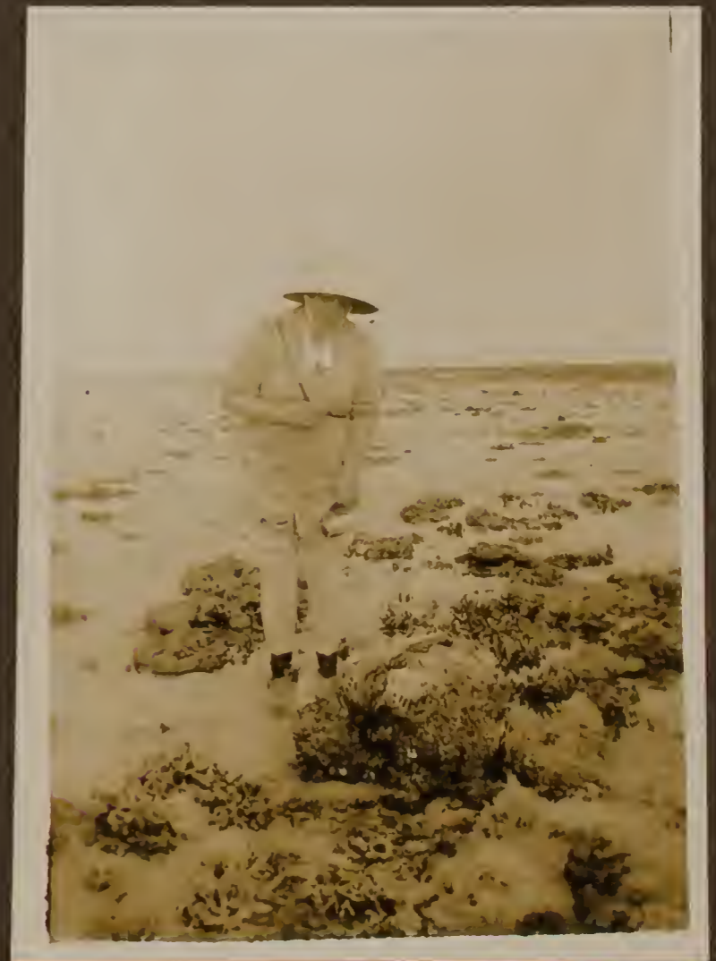
Green - Giant Clam